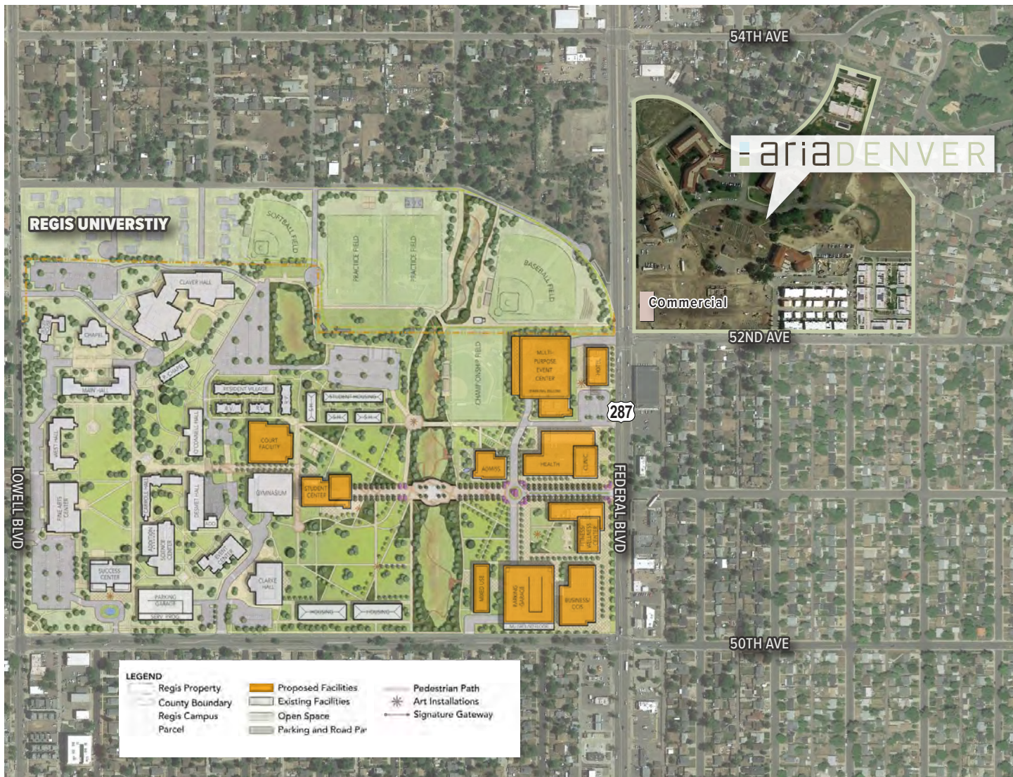
Regis University Redevelopment Plan